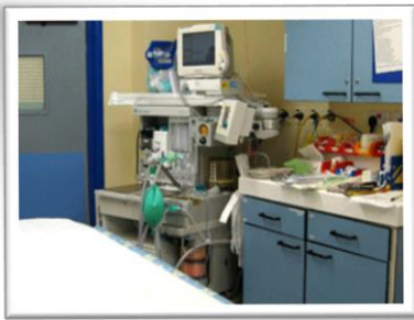
The sleep doctors' room has lots of machines in it

When you are ready, you will walk (or ride in a bed!) to a room with lots of machines in it. Here, the sleep doctors will give you some medicine. It will put you in a very deep sleep .