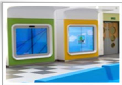
The giant iPads in the lobby

Your ABG will happen in the Royal Hospital for Children, which is in Glasgow . There are lots of fun things here- even giant iPads in the lobby, and a cinema!